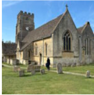
B: St Mary' Church