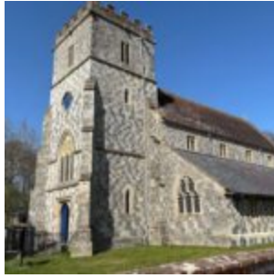
All Saints Church